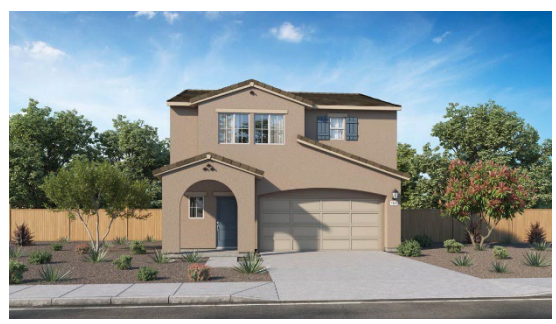
C - Mission