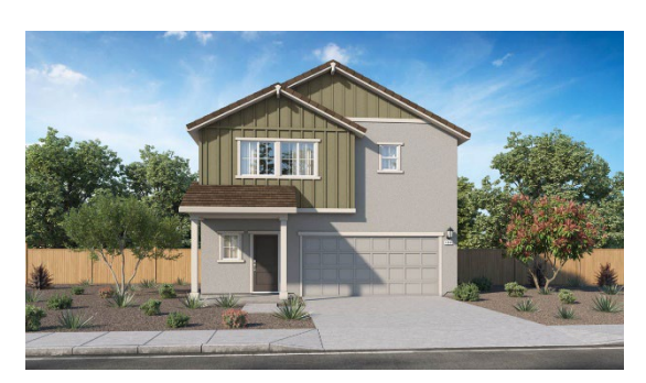
A - Farmhouse

1,811 SQ. FT. | 4 BED 2.5 BATH 2 STORY 2 CAR 2958 PIN OAK LANE, CHICO, CA 95928