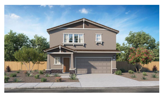
B - Craftsman