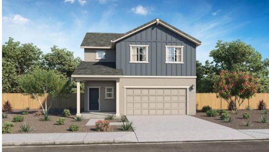
A - Farmhouse

1,678 SQ. FT. | 4 BED 2.5 BATH 2 STORY 2 CAR 2958 PIN OAK LANE, CHICO, CA 95928