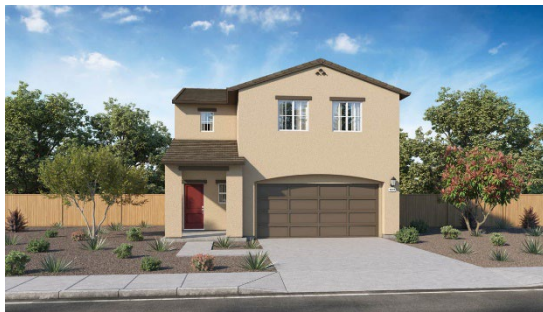
C - Mission