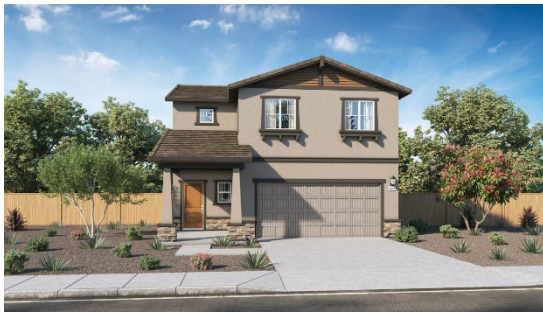
B - Craftsman