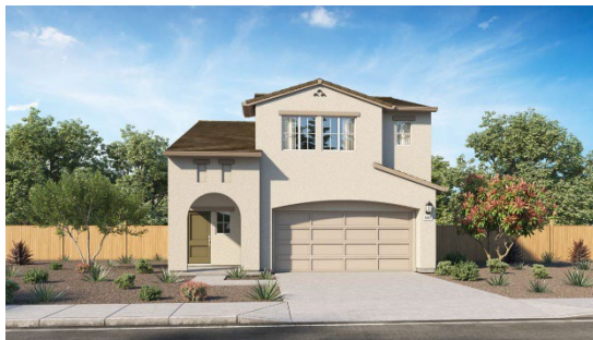
C - Mission