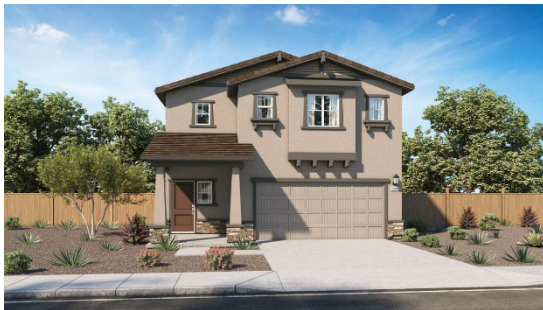
B - Craftsman