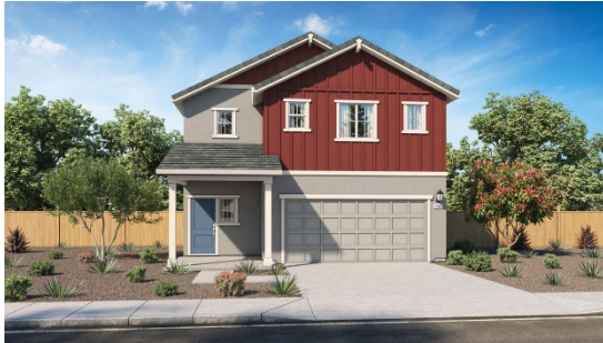
A - Farmhouse

1,547 SQ. FT. | 3 BED 2.5 BATH 2 STORY 2 CAR 2958 PIN OAK LANE, CHICO, CA 95928