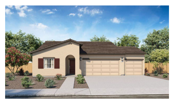
C - Mission