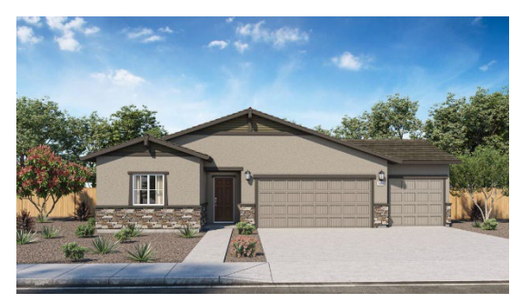
B - Craftsman