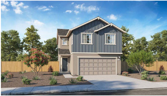
A - Farmhouse

8893 DRACUT DRIVE, ELK GROVE, CA 95758 | DRHORTON.COM/SACRAMENTO