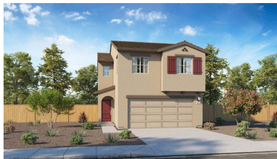
C - Mission