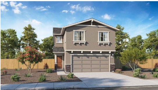
B - Craftsman