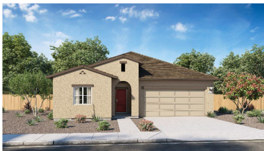
C - Mission