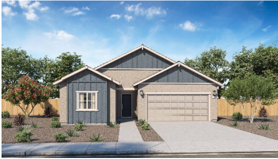
A - Farmhouse

2654 GATES HEAD WAY, REDDING, CA 96003 | DRHORTON.COM/SACRAMENTO