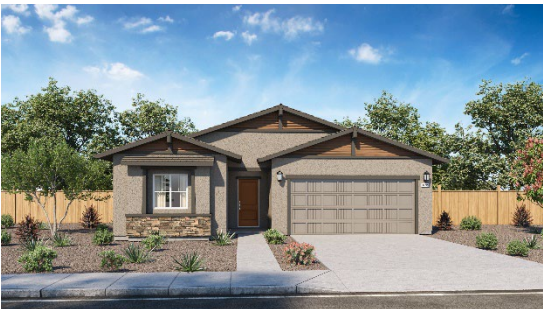
B - Craftsman