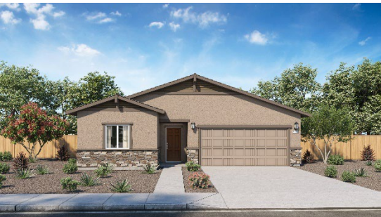
B - Craftsman