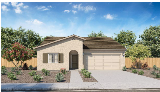
C - Mission