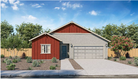
A - Farmhouse

2654 GATES HEAD WAY, REDDING, CA 96003 | DRHORTON.COM/SACRAMENTO