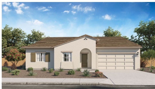
C - Mission