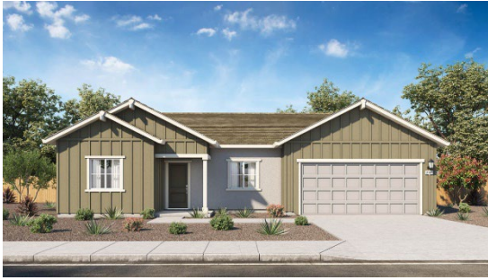
A - Farmhouse

9750 PRESERVATION STREET, ROSEVILLE, CA 95747 | DRHORTON.COM/SACRAMENTO