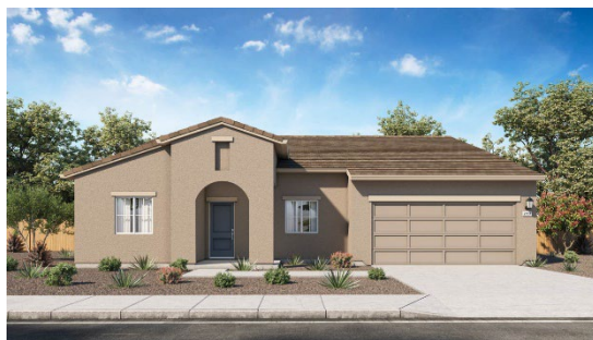
C - Mission