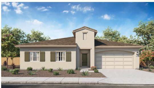
C - Mission