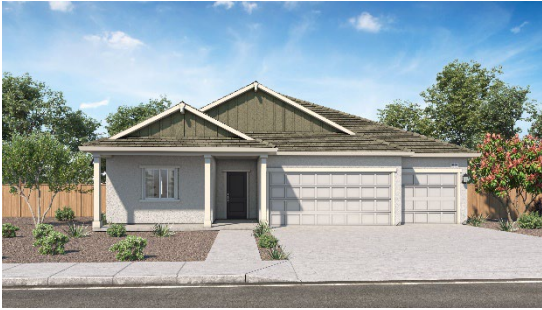
A - Farmhouse

2538 TISH TANG WAY REDDING, CA 96002 | DRHORTON.COM/SACRAMENTO