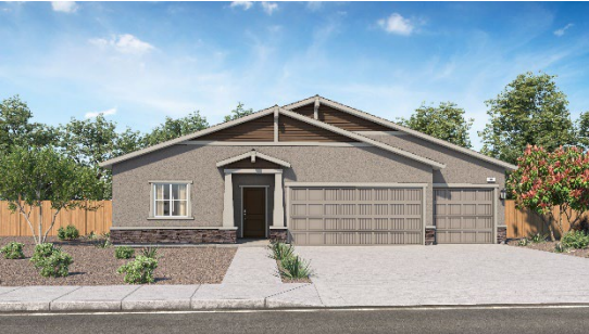
B - Craftsman