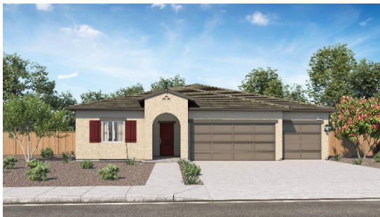
C - Mission