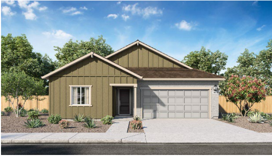
A - Farmhouse

2538 TISH TANG WAY REDDING, CA 96002 | DRHORTON.COM/SACRAMENTO