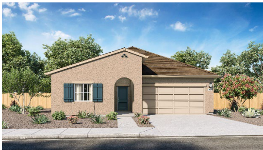
C - Mission