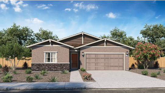
B - Craftsman