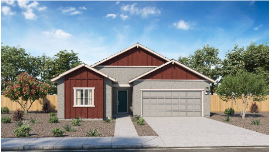
A - Farmhouse

2538 TISH TANG WAY REDDING, CA 96002 | DRHORTON.COM/SACRAMENTO