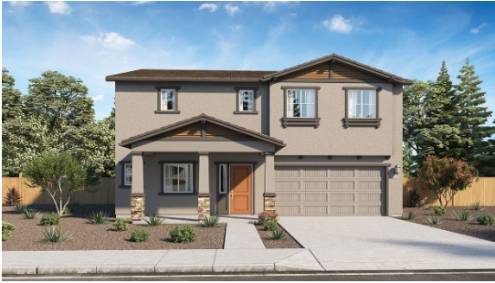
A - Craftsman

8874 KATAMA COURT, ELK GROVE, CA 95758 | DRHORTON.COM/SACRAMENTO