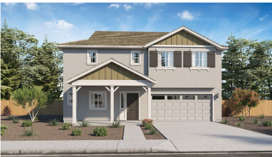
C - Farmhouse