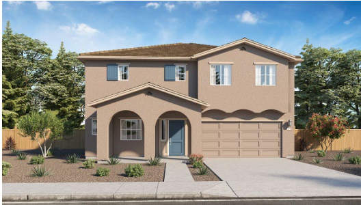
B - Mission