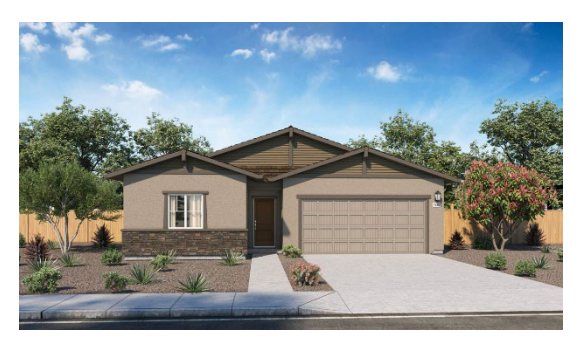
B - Craftsman