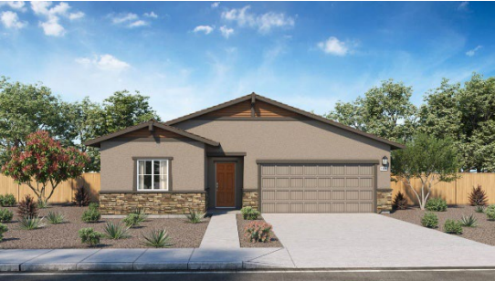
B - Craftsman