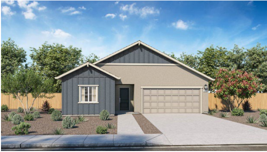
A - Farmhouse

1580 OAKWOOD DR. ORLAND, CA 95963 | DRHORTON.COM/SACRAMENTO