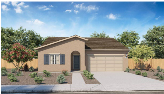
C - Mission