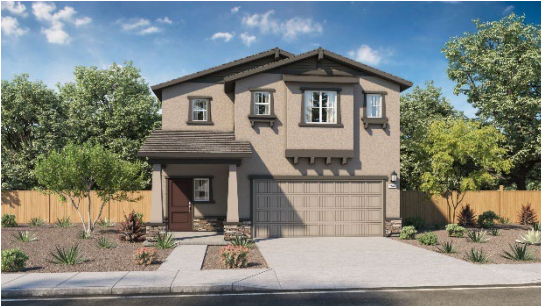
B - Craftsman