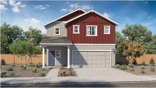
A - Farmhouse

886 PICO PLACE, CHICO, CA 95973 | DRHORTON.COM/SACRAMENTO