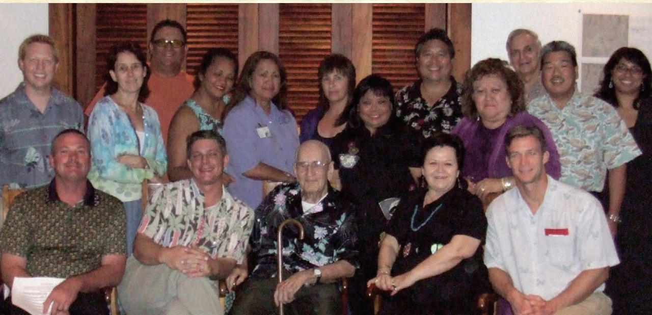
Members of the Ho'opili Task Force have been meeting for nearly two years to discuss challenges and solutions related to transportation, affordable housing and schools.

D.R. Horton estimates the first occupant in Ho'opili will take residence in 2012, with a projected build-out of the community over the next 25 years.